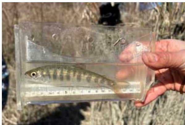
A sizeable Coho parr we found in the off-channel habitat.

Field season is underway in the s̓c̓e:łx̓w̓əy̓əm Foodlands Corridor . Early Spring monitoring is already offering encouraging signs that restoration efforts are supporting diverse species.