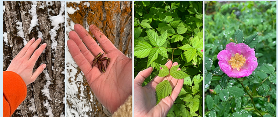
Witnessing dormant winter plants become new growth in the Spring. As the watershed wakes up with first buds of the year amidst snow cover, the cycle begins— bloom to berry, to ripe fruit, and then seed dispersal. Join us in restoring connection back into the lands and waters of the Fraser Watershed!

Thank you to those who continue to send in updates, events, and opportunities to feature in Rivershed Stories. We love highlighting work from across the watershed—please keep them coming by emailing <u>info@rivershed.com</u>. We publish on the last Thursday of each month, so a bit of advance notice is appreciated.