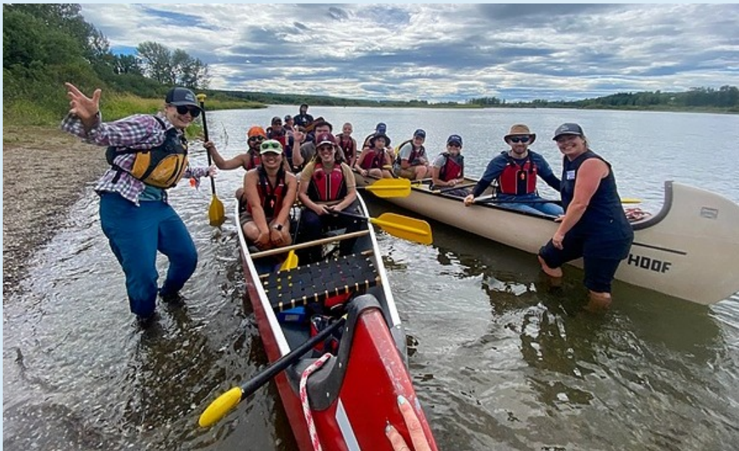
Nechako Paddle Crew.

Welcome to the March edition of Rivershed Stories! This month, some of our team had the privilege of visiting Horsefly, Vanderhoof, Prince George, McBride, and Dunster, where we had the opportunity to meet with folks who are working on initiatives aligned with Watershed CPR (Connect. Protect. Restore). A huge thank you to everyone who took the time to meet with us and share the inspiring work they are doing. These conversations were eye-opening and meaningful, and they reminded us just how much people across the Fraser Watershed care about its health and resilience. It's always energizing to hear the diverse ways communities are coming together to protect and restore the Fraser, and we look forward to continuing these connections as we work toward shared goals. Thank you for being part of this important movement.