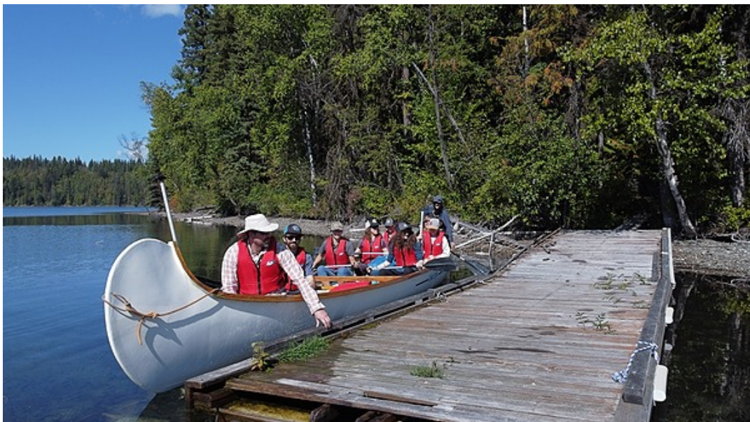
Watershed collaborators preparing to launch after a break paddling Horsefly Lake.