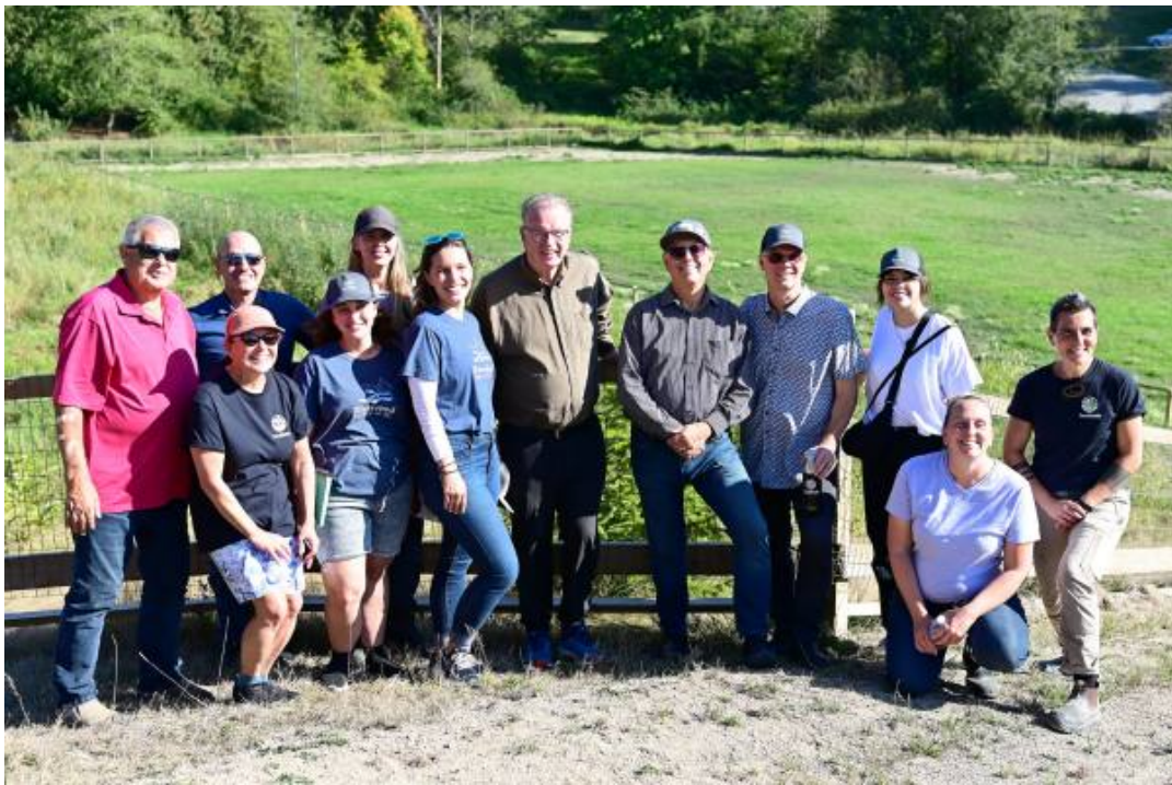
Rivershed team members and Foodlands collaborators with Members of BC's Legislative Assembly.

Foodlands also recently welcomed four Members of BC's Legislative Assembly to the s̓c̓e:ɬxʷəy̓əm (Salmon River)* Corridor for a tour of the project site and to meet some of our team. A big thank you to Minister of Water, Land and Resource Stewardship Nathan Cullen; Minister of Forests Bruce Ralston; Minister of Indigenous Relations and Reconciliation Murray Rankin; Parliamentary Secretary for Watershed Restoration Fin Donnelly; and staff for taking the time to join us and learn about our work.