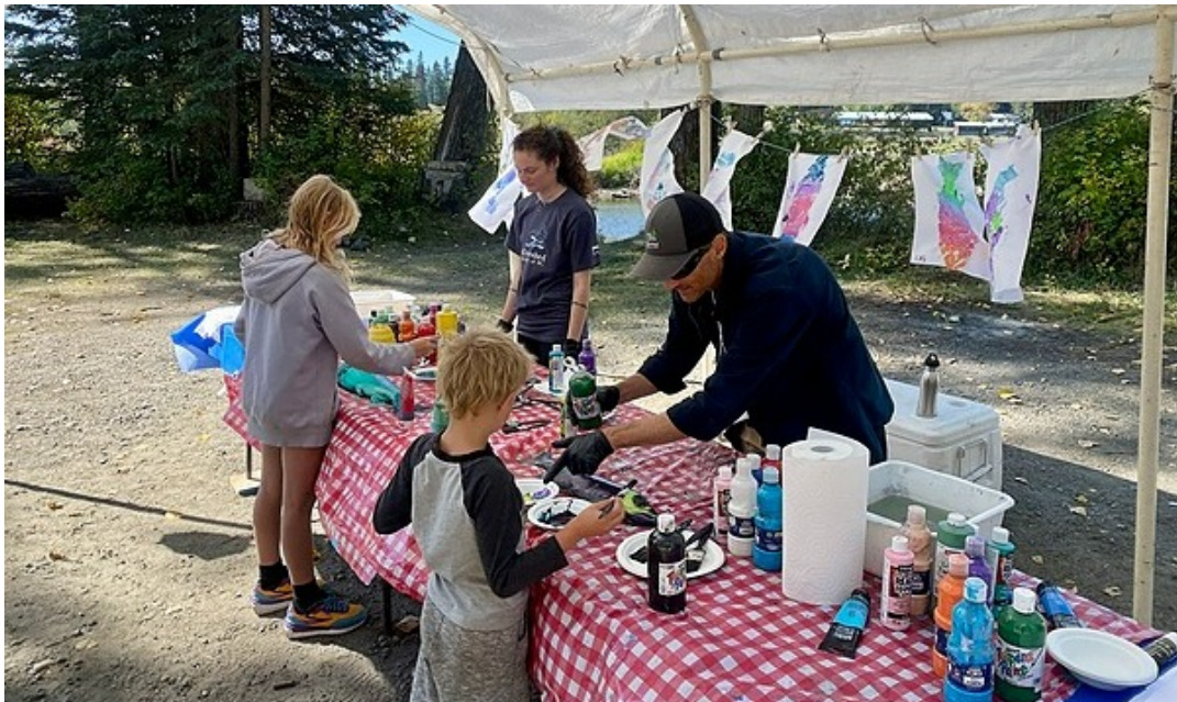
Rivershed team members help young artists make salmon prints at the Horsefly Salmon Festival.

Rivershed staff attended events around the watershed including the Horsefly Salmon Festival in the Cariboo-Chilcotin, Spruce City Wildlife Association 's brood capture in the Nechako and RiverFest in the Lower Fraser.