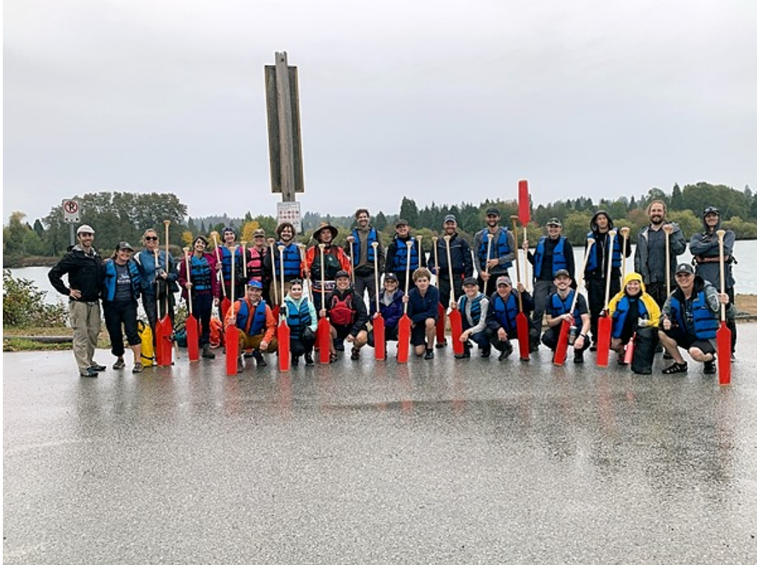
Group shot after the final 2023 River Clinics paddle on BC Rivers Day.

Chilcotin and Lower Fraser. Our on-the-water journey culminated on our favourite day of the year—Rivers Day—with a paddle from Coquitlam to Richmond.