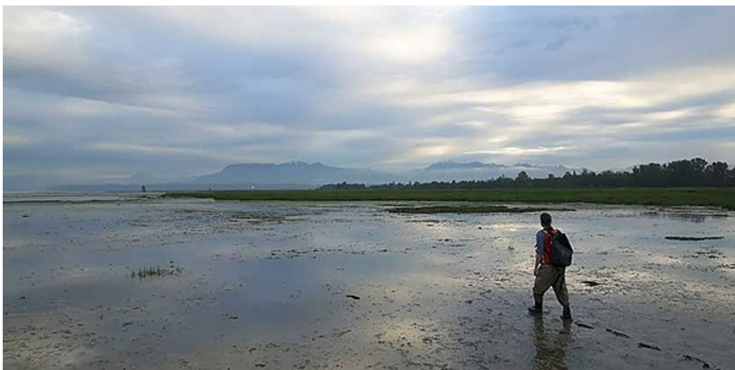
Sturgeon Bank, Photo courtesy of Ducks Unlimited Canada

An emergency order would allow Ottawa to prevent B.C. from logging in old-growth forest habitat where the at-risk species live. At this time, it's believed there are only four northern spotted owls in the wild in BC. Read more.