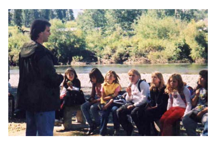
Fin talks Salmon Life Cycle to students along the Horsefly River.