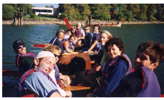
BC Rivers Day Paddlers take a break on the Fraser River.