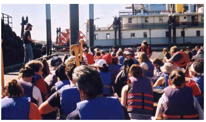
Jay Ritchlin, Reach For Unbleached talks to paddlers.