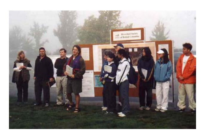
Fin and Cameron welcome all to Spirit of the Salmon Paddle.