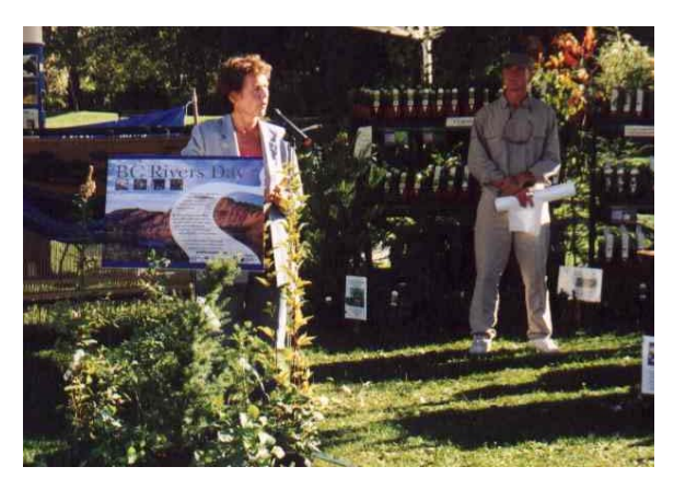
Enviro Minister Joyce Murray speaks to paddlers in Burnaby.