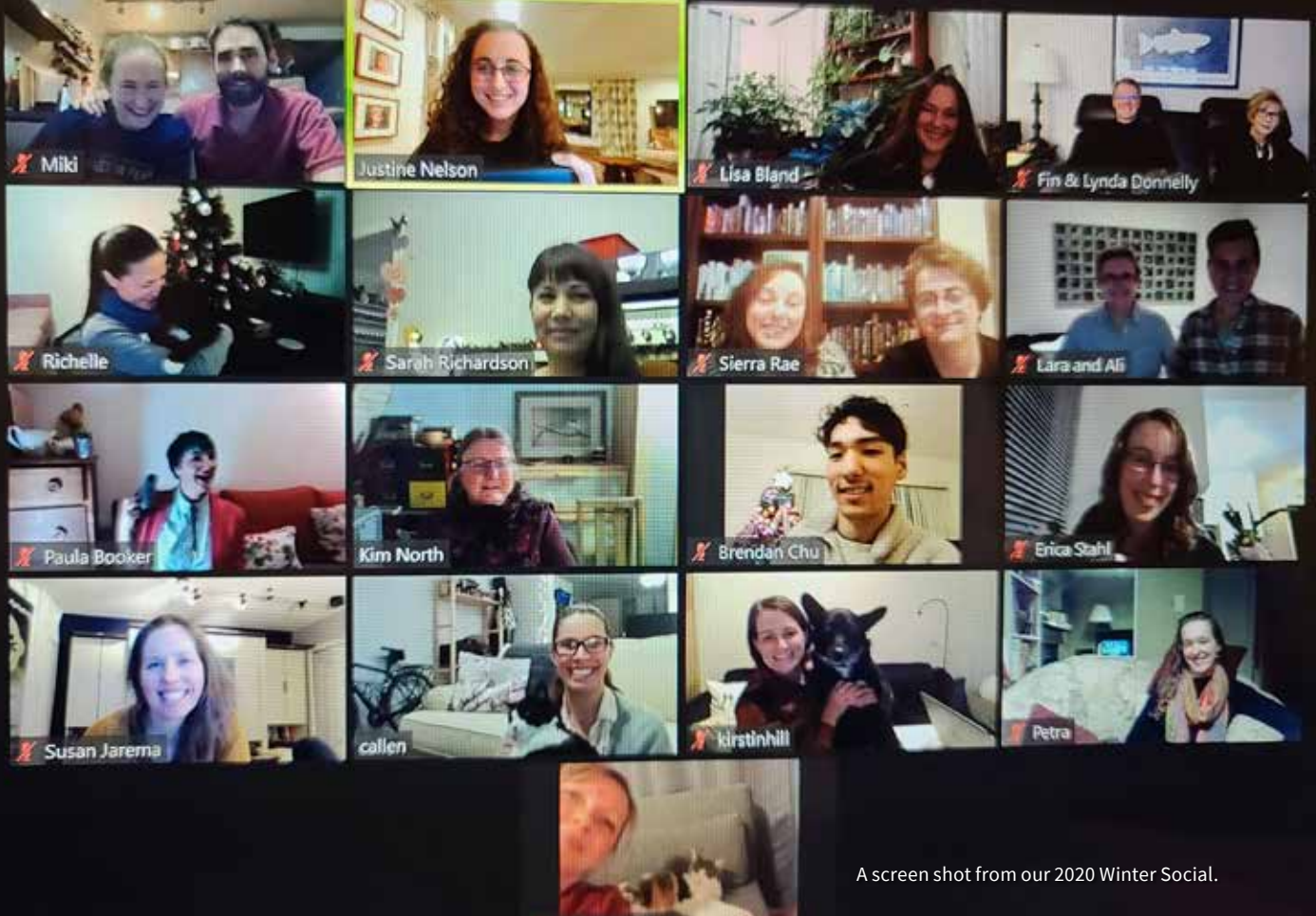
A screen shot from our 2020 Winter Social.